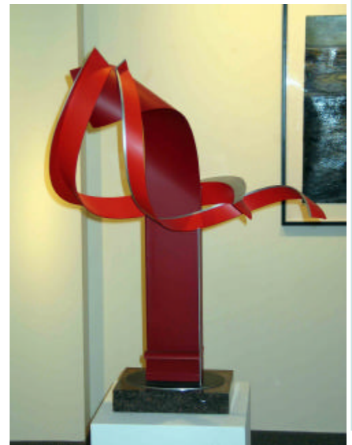
Duet by David E. Davis. Aluminum and marble, 42 x 32 x 18 inches, 1999. Collection of the AAWR.