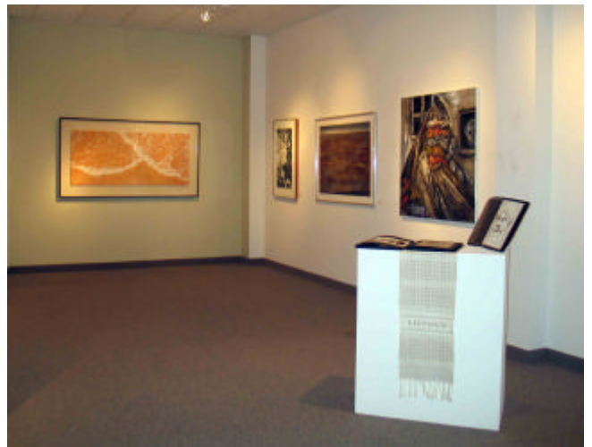
A view of the gallery during Marking the Passed in October.

Be on the look out for a supplementary issue of ARTSWIRE regarding these and other new artists to the AAWR.