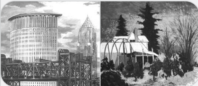
Phyllis Seltzer, Court House B(2) , 2002